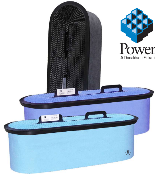
PowerCore® CP Filter Pack

PowerCore® A Donaldson Filtration Technology